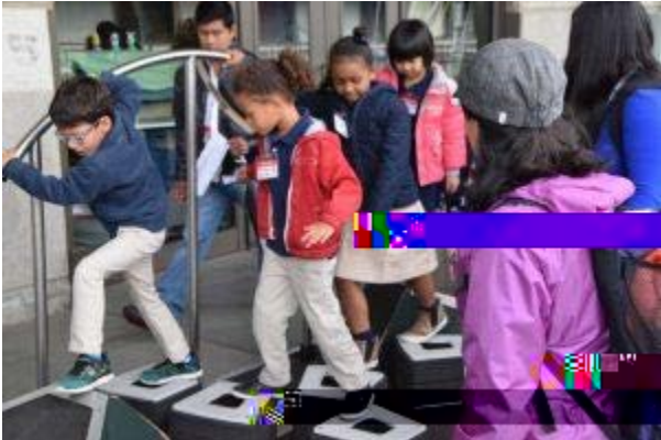
WCMS students at the Exploratorium, November 2017