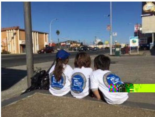
WCMS students taking a break at the 23 rd Street Community Clean Up