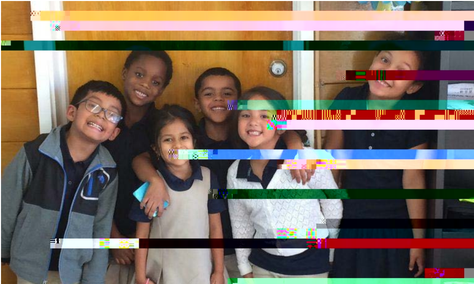
WCMS students in our After School Program