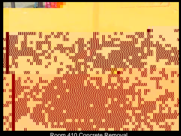
Room 410 Concrete Removal