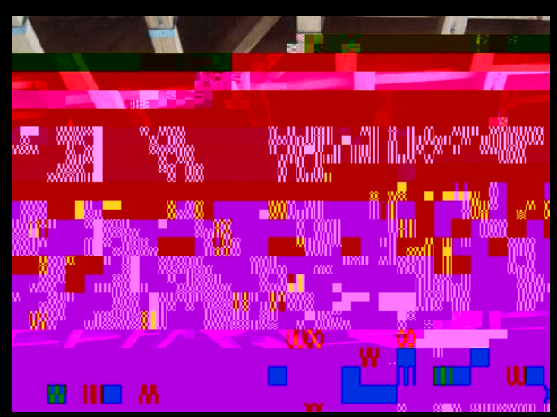
Covered Walkway Ceiling Removal